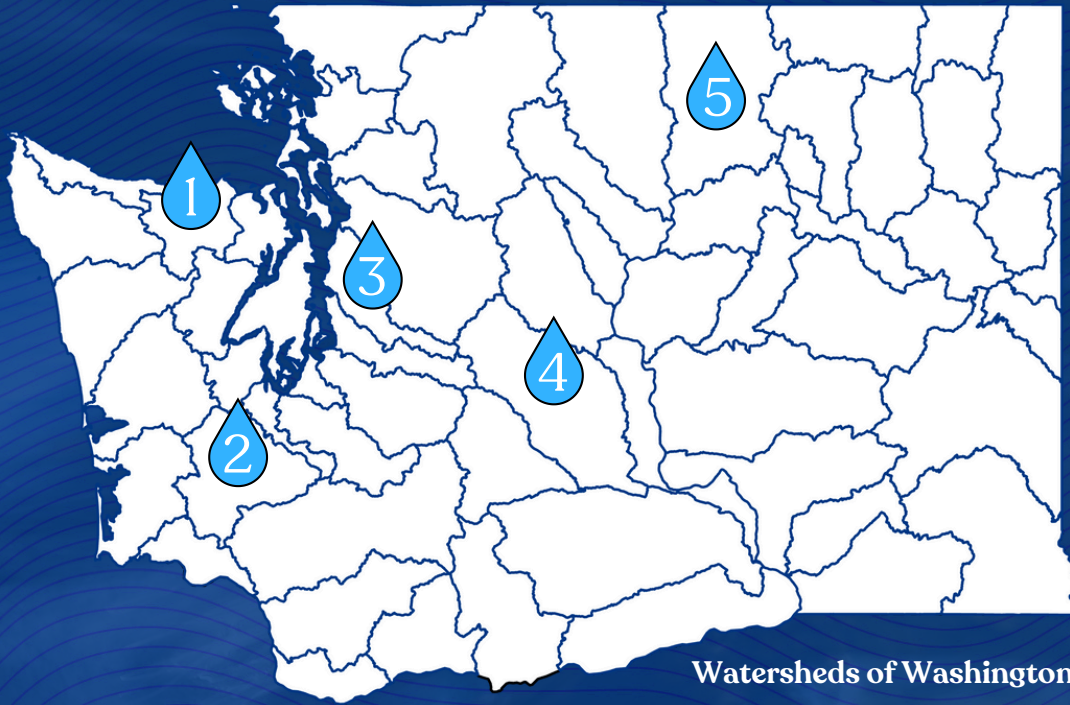
Watersheds of Washington